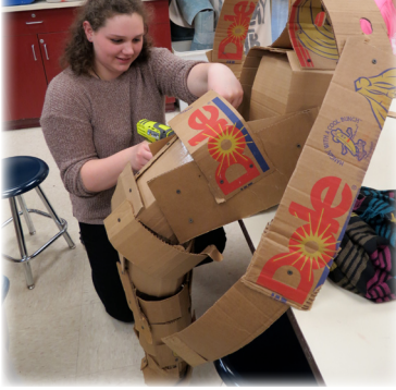
Ceramics and Fibers

MSA currently offers Programs of Distinction in 9 areas. For more information on Middle States Programs of Distinction visit our website.