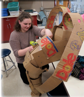
Ceramics and Fibers